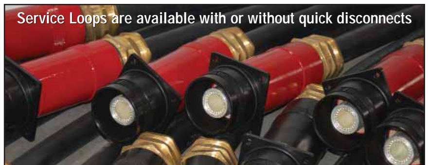
Service Loops are available with or without quick disconnects